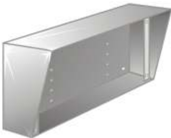
external stainless steel enclosure